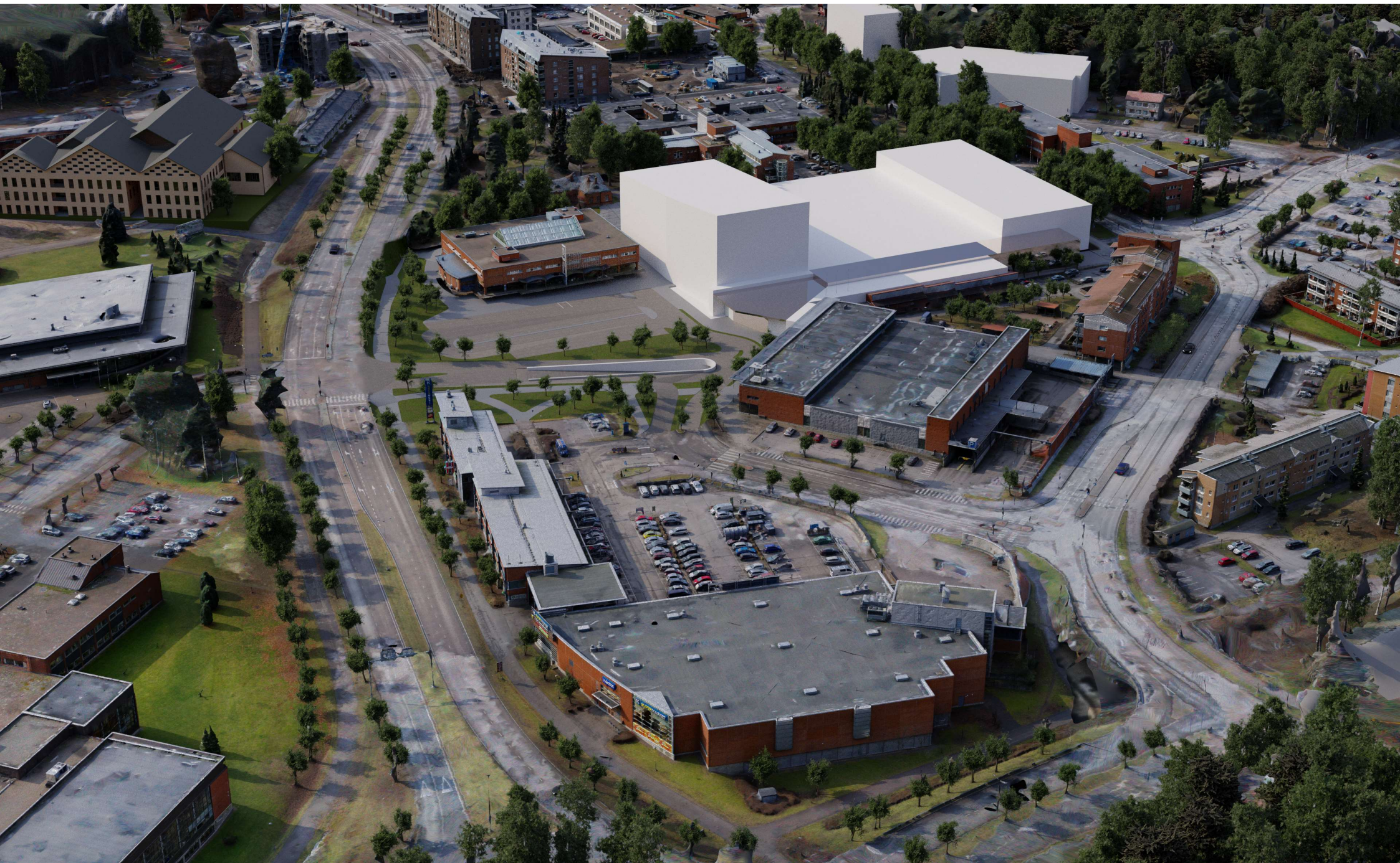
Ve 2 pohjoisesta